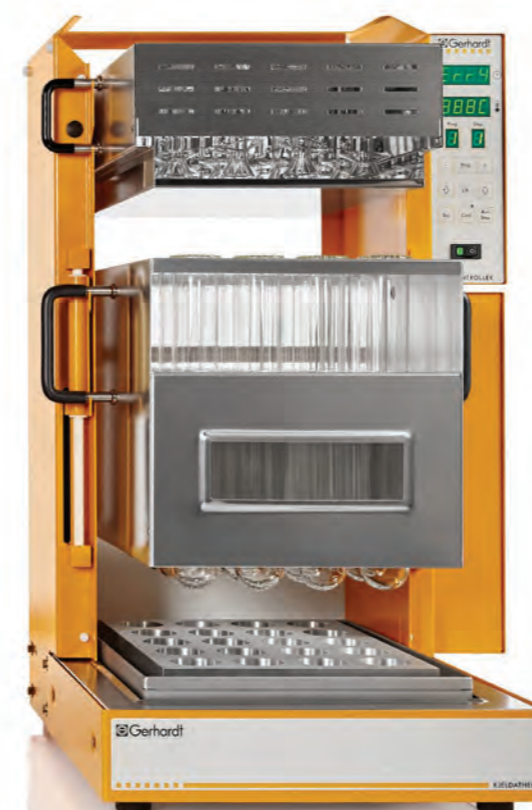
For example KBL 20S TZ